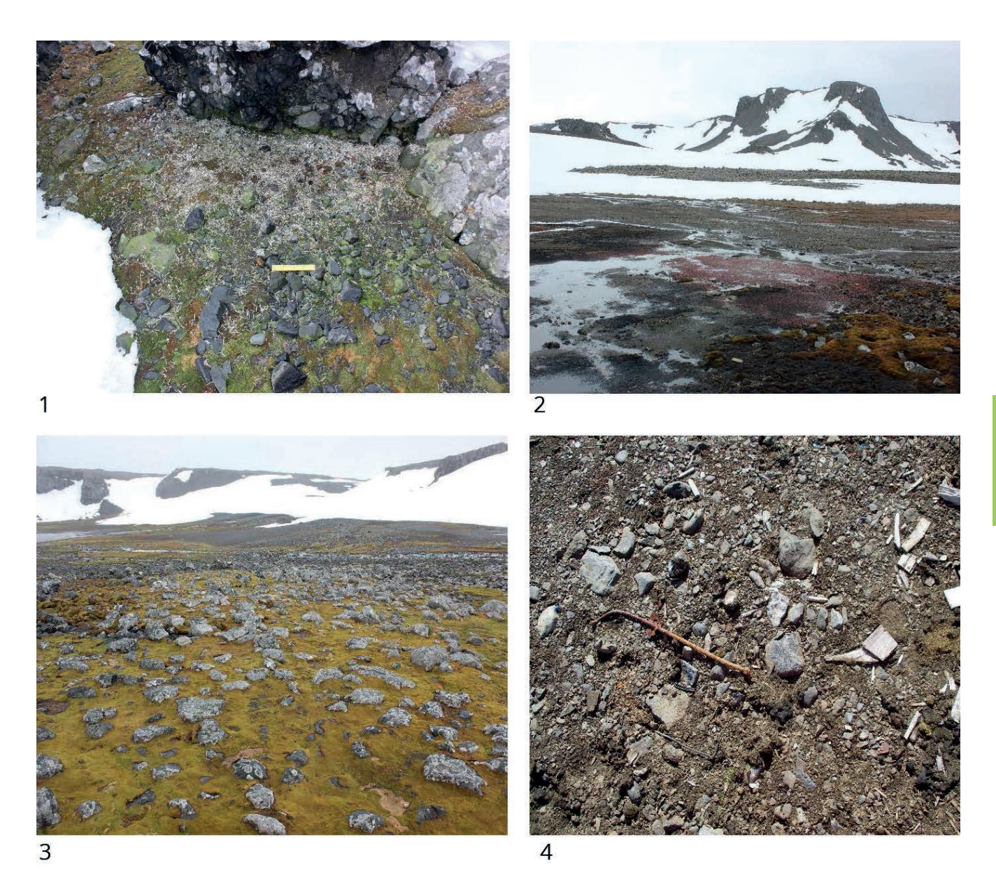
Fig. 2. Examples of soils: 1) soil under ornithogenic effect (sample 1); 2) organogenic mat (sample 6); 3) soil without pronounced ornithogenic effect (sample 13); 4) soil under the former waste disposal (sample 18)

Total organic carbon and nitrogen were determined with a C-H-N- analyzer (Euro EA3028-HT). For the extraction of ammonium nitrogen, we used KCl (EPA method 350.1., August 1993). Mobile phosphorus and potassium content was determined using their extraction by 0.5 mol/L HCl (Kuo, 1996). The evaluation of the main agrochemical characteristics was performed by the standard procedures recorded in GOST 54650–2011 (for evaluation of mobile phosphorus and potassium contents) and GOST 26489– 85 (for evaluation of ammonium nitrogen content).