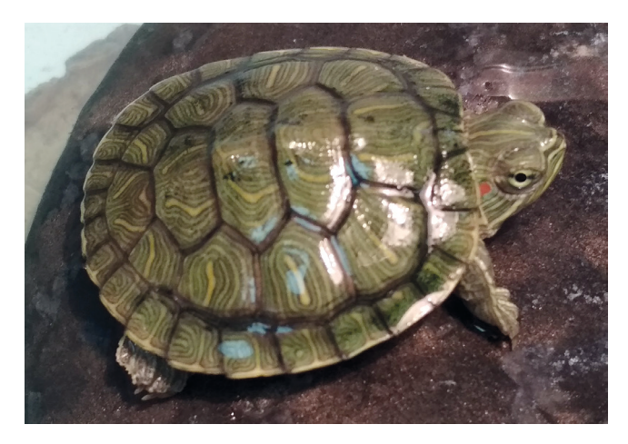
Fig. 1. Juvenile red-eared slider Trachemys scripta elegans.