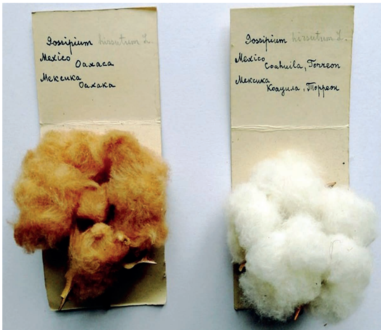
Fig. 1. The examples of white and brown cotton samples from Herbarium collection of N. I. Vavilov All-Russian Institute of Plant Genetic Resources.

The current review summarizes known data on molecular-genetic mechanisms underpinning pigmentation of fibre during cotton plant development. The metabolic pathways as well as structural and regulatory genes related to pigment synthesis in green and brown cotton fibre are considered.