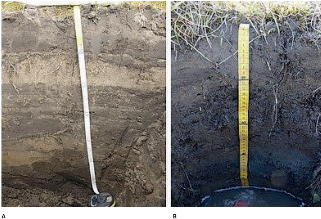
Fig. 3. Morphological diversity of soil in Lena River Delta: A — Fluvisols (Arenic), B — Folic Cryosols (Fluvic)

on sample direct combustion and further evaluation of emitted \text{CO}_2 by chromatography. During oxidation all the organic carbon turns into carbon dioxide. Further on, in resulting products of combustion utilized from chlorides and other halogens, the measurement of carbon dioxide takes place (Abakumov and Popov, 2005). To refine Cox we used Tyurin's method (Orlov, 1985). The main principle of Tyurin's method is wet combustion of sample by \text{K}_2\text{Cr}_2\text{O}_7 solution in sulphuric acid followed by determination of oxidizer value by titration method using Mohr's salt. All measurements were performed in triplicate.